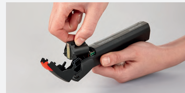
Simple change of cartridge inkjet

Fully Mobile! Prints Texts, Date, Time, counting, numbering, or coding, almost anywhere, on flat, uneven, rigid or soft surfaces. Set up your Texts, etc. to suit Left- or Right-handed users, on your PC.